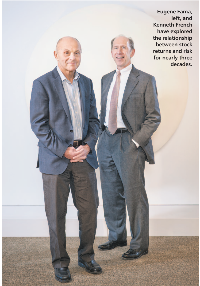
Eugene Fama, left, and Kenneth French have explored the relationship between stock returns and risk for nearly three decades.

The basics of market efficiency are often misunderstood. Some say that if factors such as a stock's value, size, trading momentum, and profitability—all of which are part of your multifactor model—indicate outperformance, then the market isn't really efficient.